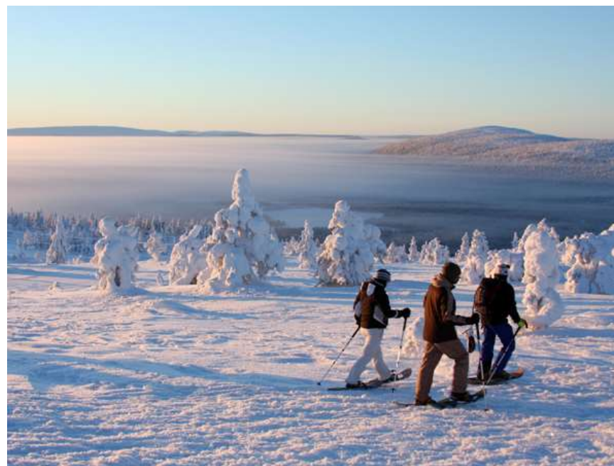
Kittilä in Januari