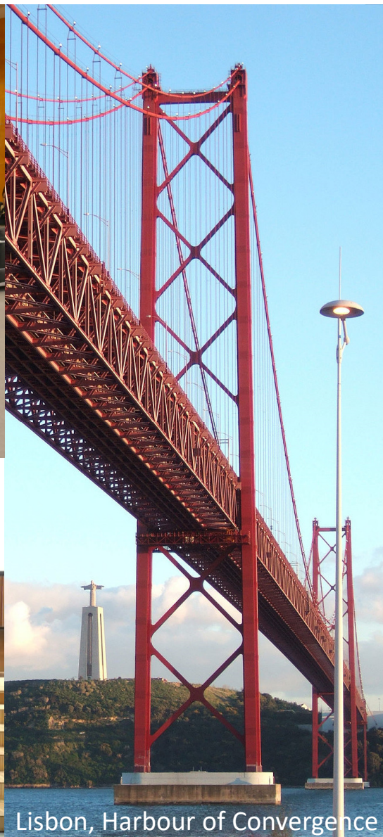
Lisbon, Harbour of Convergence